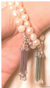
CYNTHIA WATKINS Bouquet Earrings: Sterling Silver, Freshwater Pearl, White Topaz retail price $75.00