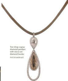
Tear drop cognac diamond pendant with micro-set diamond border