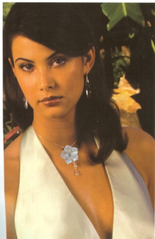
Aloha Necklace: Sterling Silver, Mother of Pearl, Freshwater Pearl, White Topaz retail price: $99.00