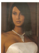
Atlantis Necklace: Sterling Silver, Mother of Pearl, Freshwater pearl, White Topaz retail price: $99.00